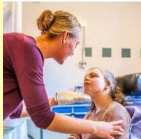
Health (Mental & Physical)