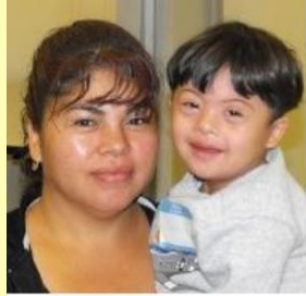
Childcare, Respite, Community Engagement