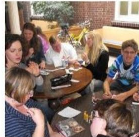
Social & Recreation