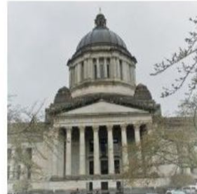
Government Agencies & Programs