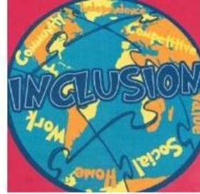
Employment & Finances