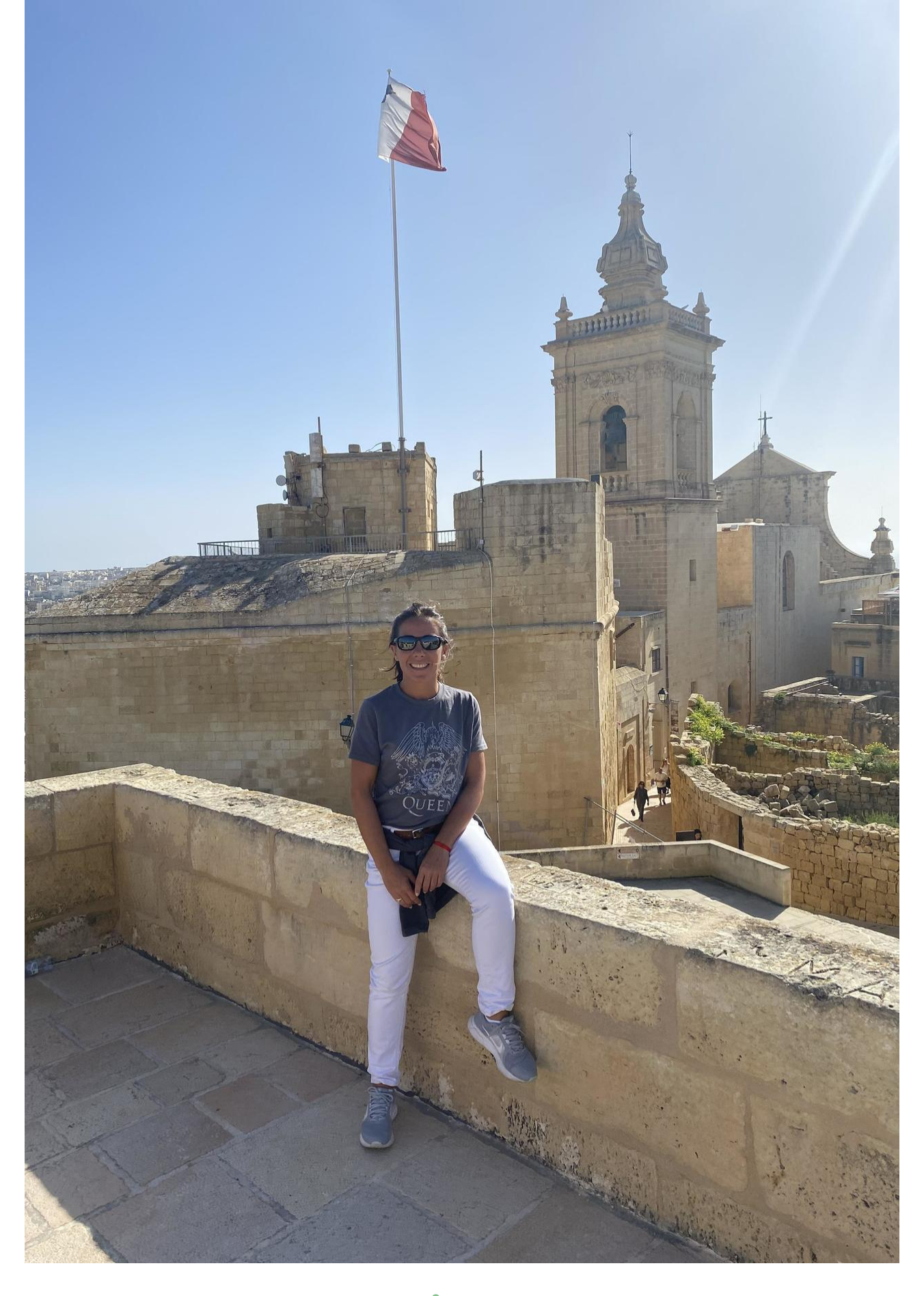
Upcoming Travel! Emerging Destinations On The Road