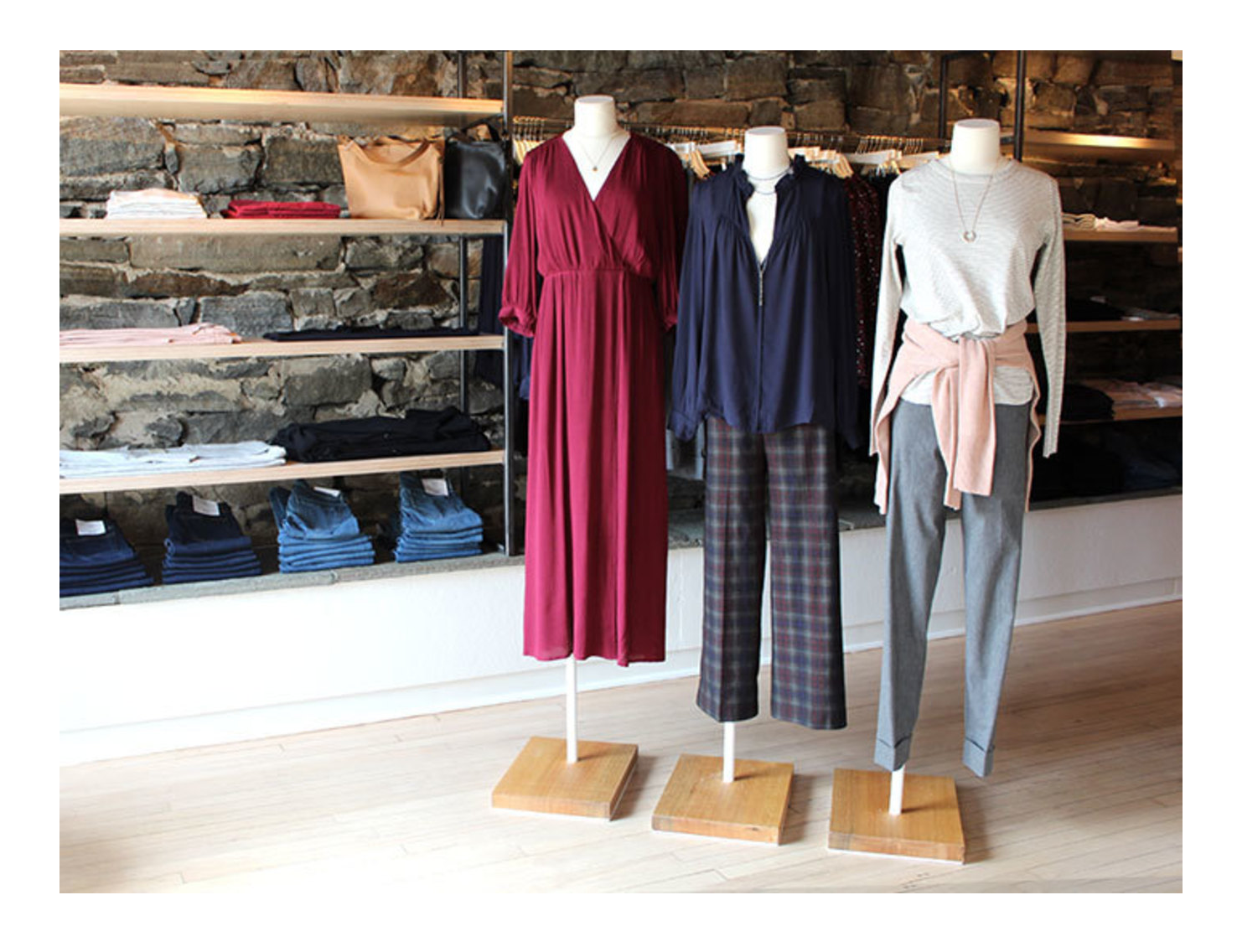
Lots of fun new fall arrivals in lighter weight, wear-now fabrics. I LOVE