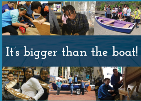
celebrating youth engaged in learning

With your generous SUPPORT we can continue to bring our unique and powerful programming to underserved youth across the Portland metro region. Please visit us at our website www.windandoar.org and follow us on Facebook and Twitter , and Instagram .