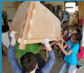
Happy kids flip their boat