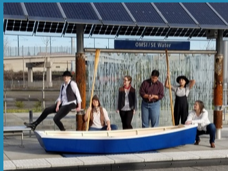
Community partners cross support the arts!