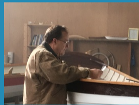
Mentor reading letter from mentee