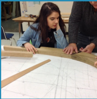
math is essentialt