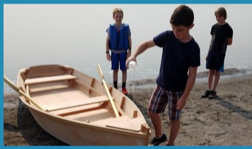
christening the finished boat