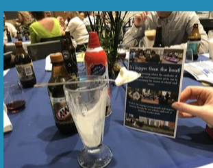
thanking all the supporters