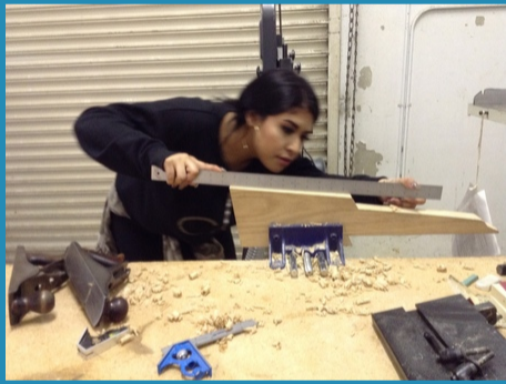
learning skills, becoming a craftsman