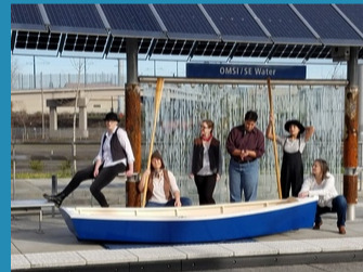
Community partners cross support the arts!