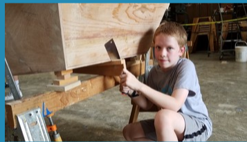
building kids are happy kids