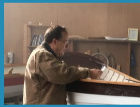
Mentor reading letter from mentee