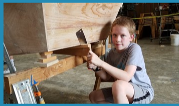
building kids are happy kids