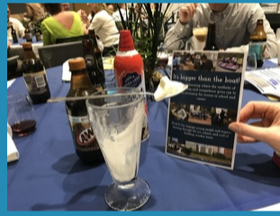
Thanking all the supporters