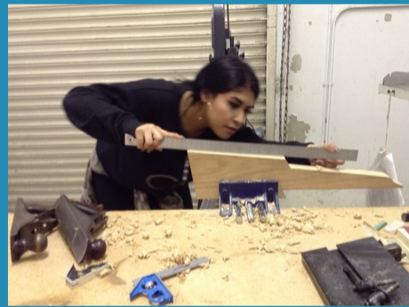
learning skills, becoming a craftsman