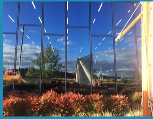
Root Beer Float-tilla: what a night