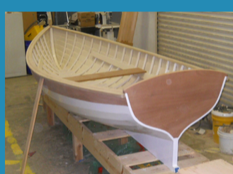
Whitehall #2 by Merlo Station kids