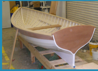
Whitehall #2 by Merlo Station kids