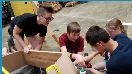
collaboration and problem solving