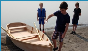
christening the finished boat