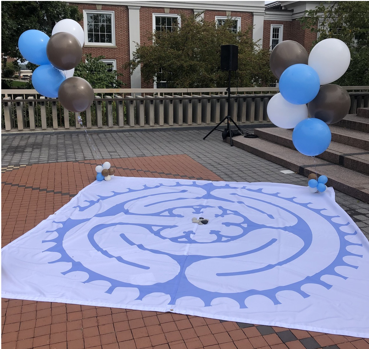
Labyrinth at the Mental Health and Wellbeing Fair, Monday October 3, 2022