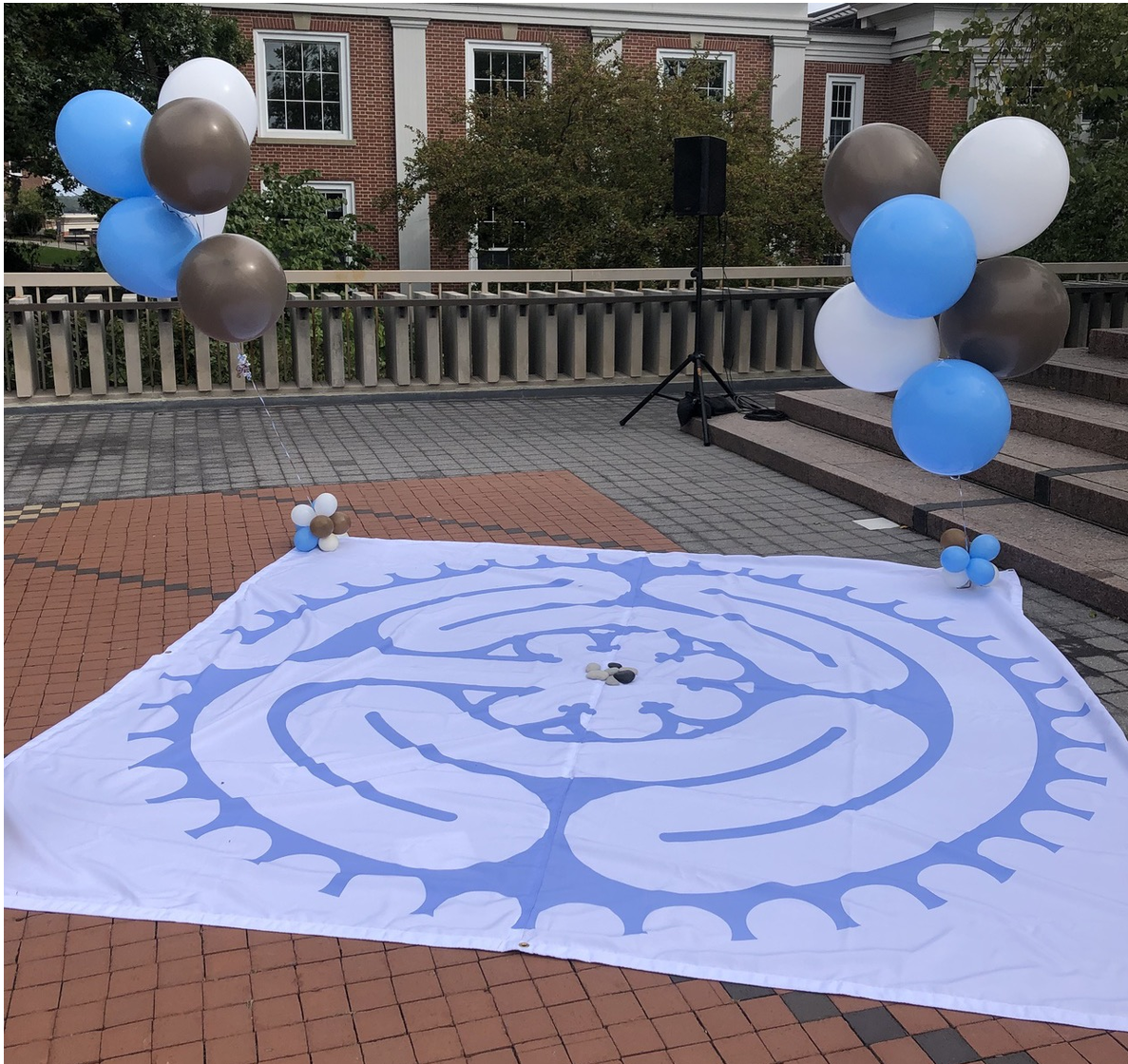
Labyrinth at the Mental Health and Wellbeing Fair, Monday October 3, 2022