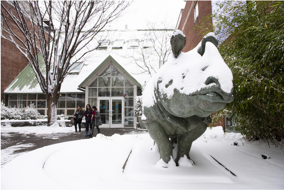
Rosie the Rhino covered in snow at the SMFA