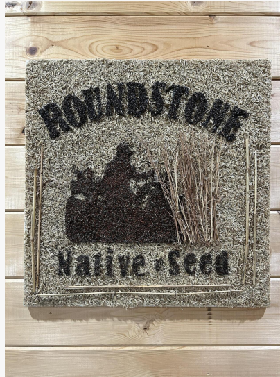
Image of the logo of Roundstone Seed LLC made entirely of seeds and plant materials.

SGI is a proud partner with Roundstone Native Seed, LLC , a farm growing native plants and providing essential native seed resources to the Southeast. Roundstone is an important part of the SGI origin story, and still works closely with our programs today. Click the button below and read our blog to learn more about Roundstone's story and get inspired by what hard work can accomplish!