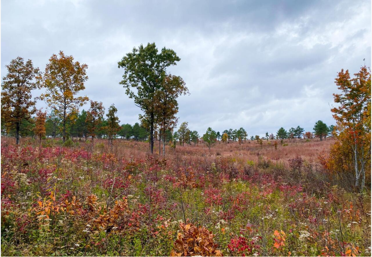
Dry Shortleaf Pine–Oak SavannaWoodland, showing recently restored high-quality examples or remnant sites. Savanna landscape, Bridgestone-Firestone Prescribed Fire Demonstration Area (BPFDA), White Co., TN.