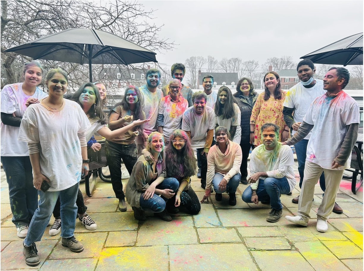
Holi at Fletcher on March 26