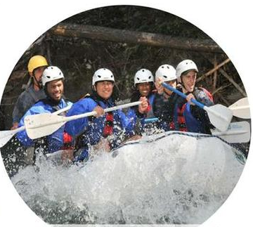
Experience nature through fun visits to local farms, forests, lakes, national parks, and research sites.

Intern with local conservation/ environmental organizations from across sectors in Michigan and develop a professional network (second year scholars).