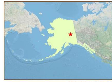
Tanana Valley, AK

University students interested in archaeology are encouraged to apply for the Adelphi University Archaeological Field Methods in Alaska course. With a student to instructor ratio among the lowest available (3:1), you will participate in ongoing research and make new discoveries. Excavate the newly discovered Holzman site along Shaw Creek where we are investigating the interaction of Ice Age people with mammoth and other large fauna. Join us as we investigate the question, who were the First Alaskans?