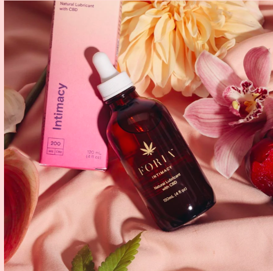
Natural Lubricant with CBD by Foria Wellness

This month on the blog we're talking all things authentic love & women's wellness and how stress can impact it all! Get ready for an honest conversation on all things Valentine's Day.