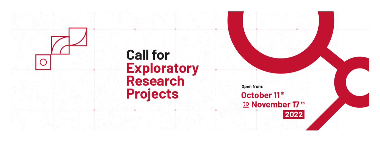
CMU Portugal has a new call to bootstrap new Exploratory projects in ICT

The Carnegie Mellon Portugal Program has an Open Call from October 11th, 2022 through November 17th, 2022 for Exploratory Research Projects (ERPs) in strategic emerging areas of ICT, funded through the Fundação para a Ciência e a Tecnologia (FCT). This is the third Call for ERPs since the Program started its 3rd phase in 2018. ERPs are an initiative focused on bootstrapping high-impact potential research activities between Portuguese Institutions and Carnegie Mellon University (CMU).