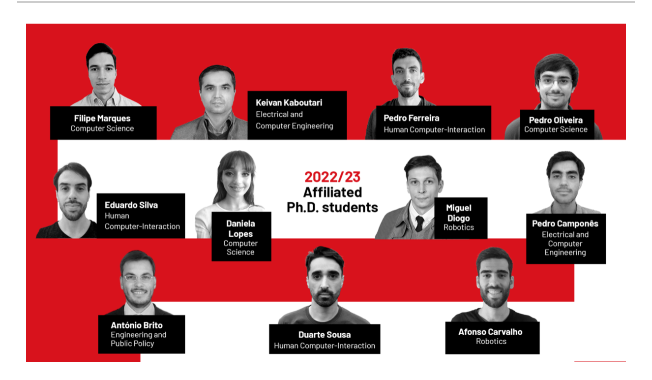
CMU Portugal has new 11 Affiliated Ph.D. students

The CMU Portugal Program welcomes a new group of 11 students selected under the second edition of the Affiliated Ph.D. Programs, starting their studies in the 2022/23 academic year. This initiative offers Ph.D. scholarships in selected cutting-edge areas of Information and Communication Technologies (ICT), related to the scope of the CMU Portugal Program.