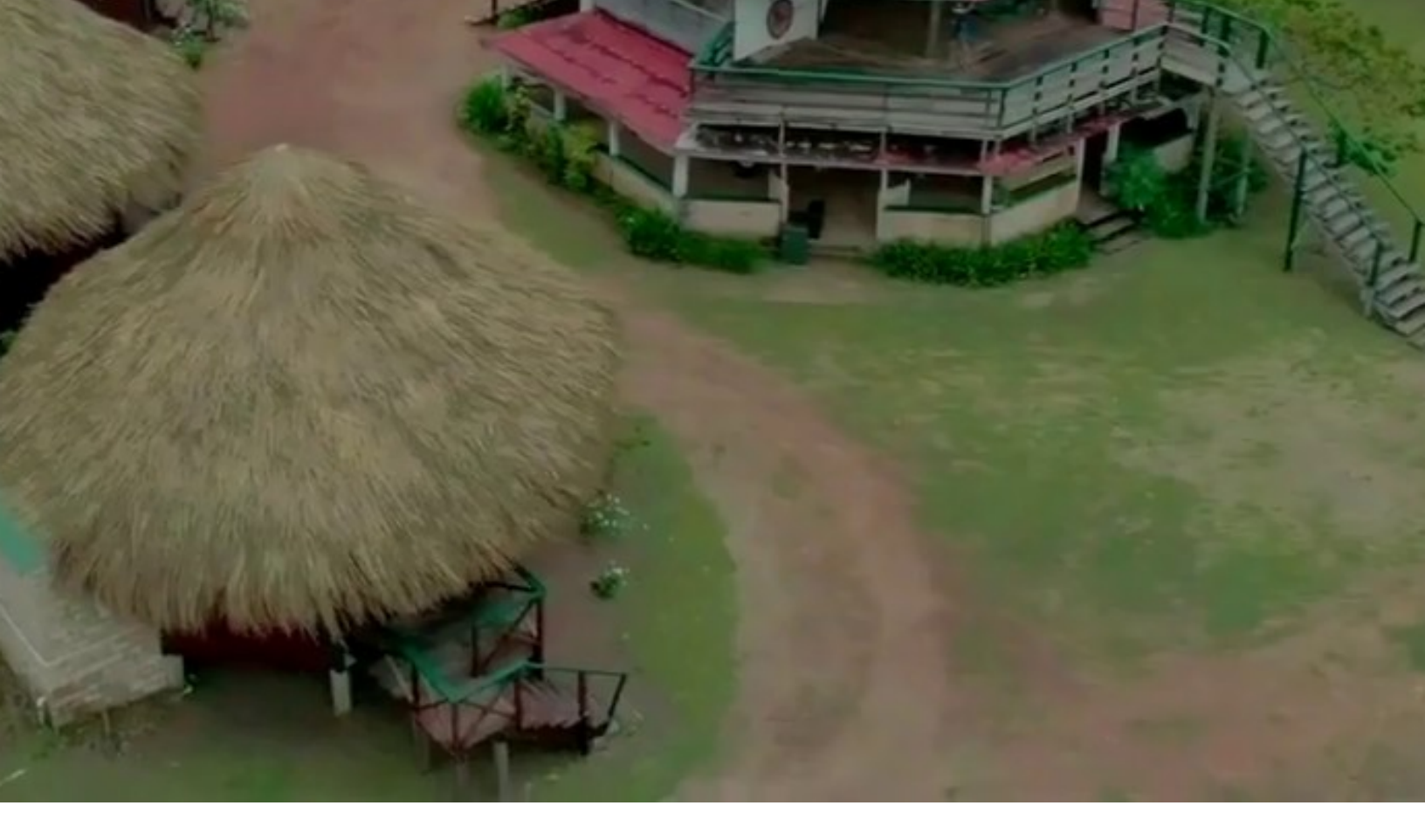
Welcome to Guyana

Discover <u>Guyana</u>. A land of diverse landscapes, enticing wildlife, exciting people, rich culture and heritage, delicious cuisine, the Majestic Kaieteur and a once in a lifetime experience. Every adventure you have in this amazing country will be a memory you carry with you forever.