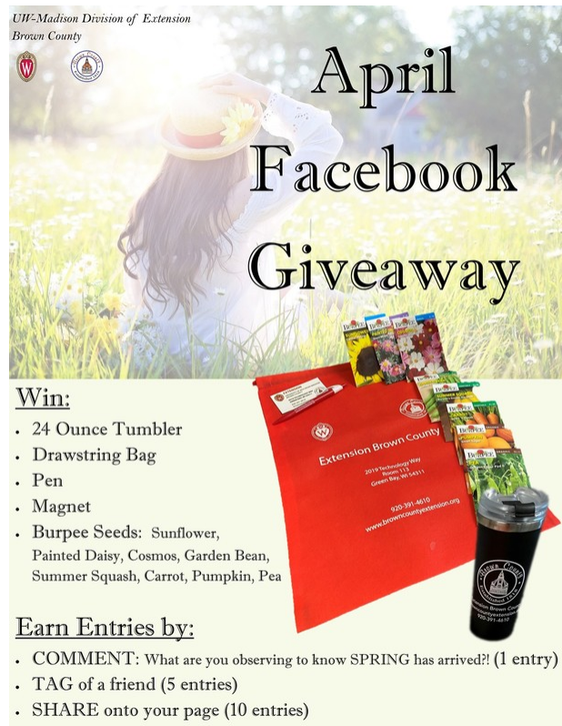
April Giveaway Flyer

Simply go to our Facebook page to participate!