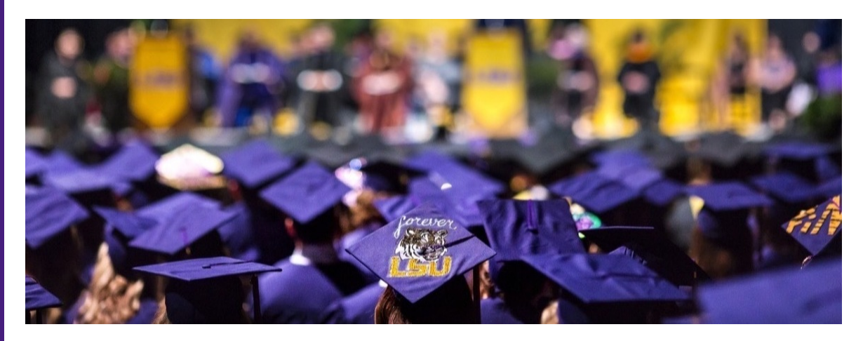
Fall Commencement - December 17, 2021

Stay tuned for the announcement of next year's Family Weekend date soon!