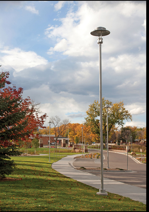
Mariposa, Denver Colorado