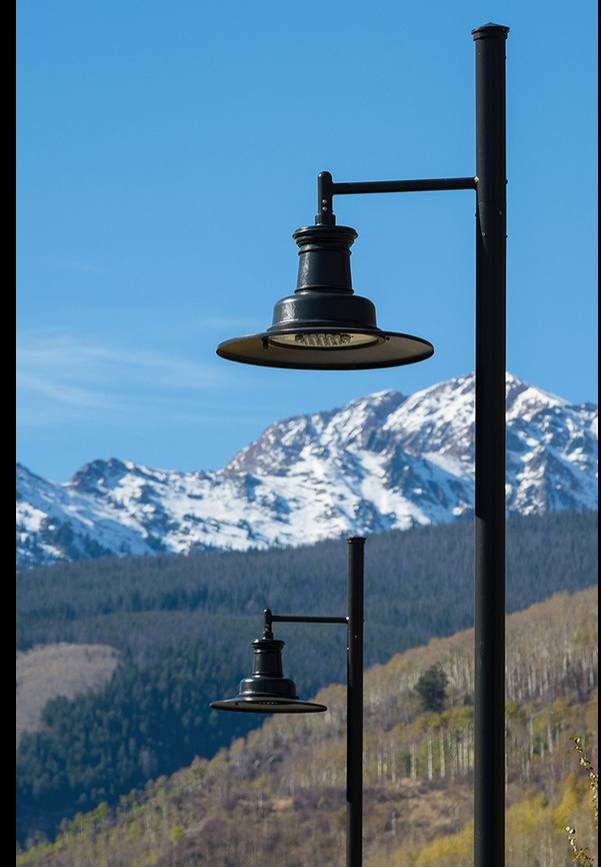
Denver Union Station, Retrofit