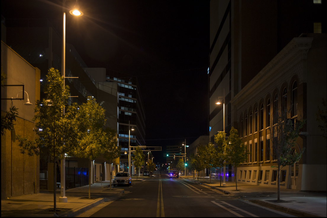
Before Retrofit (150-watt MH, 250-watt MH)