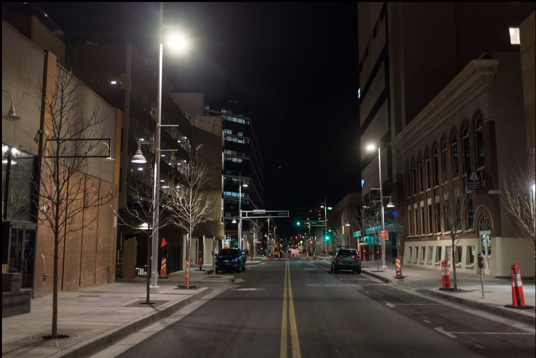
After Retrofit (29-watt LED, 78-watt LED)