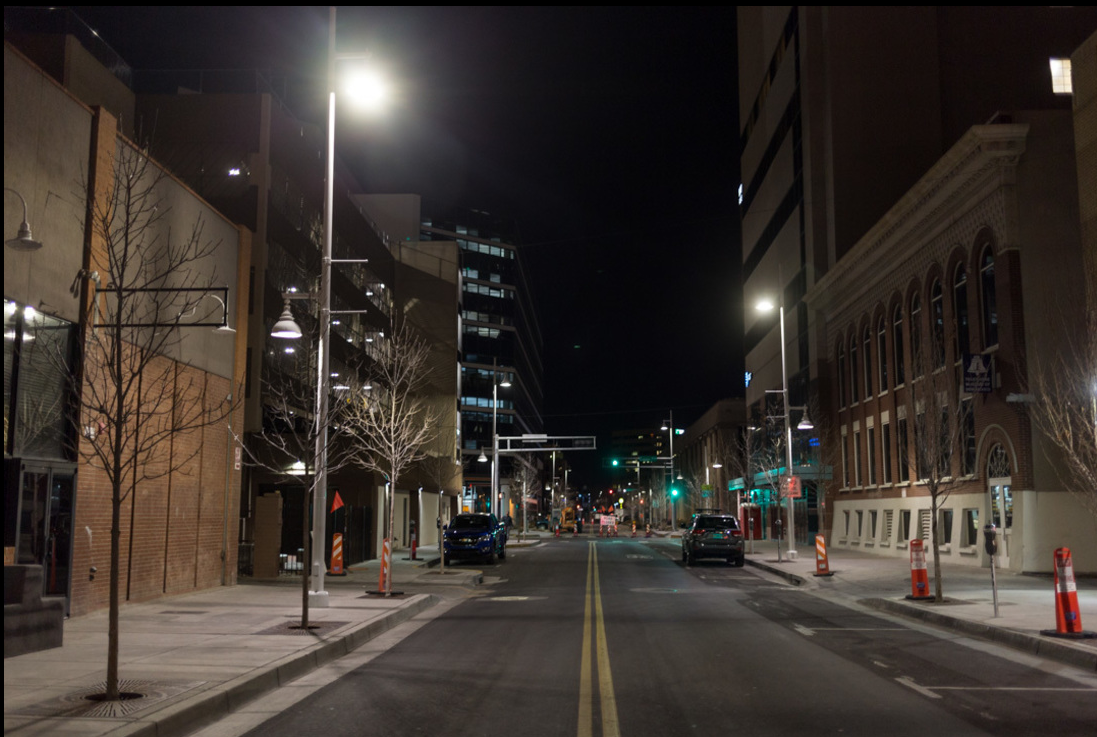
After Retrofit (29-watt LED, 78-watt LED)