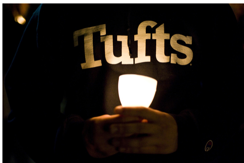
A scene from the 2019 Illumination Ceremony