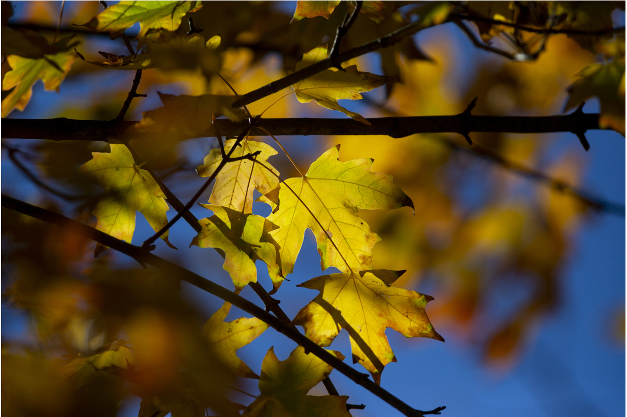
Yellow maple leaves on Medford/Somerville campus