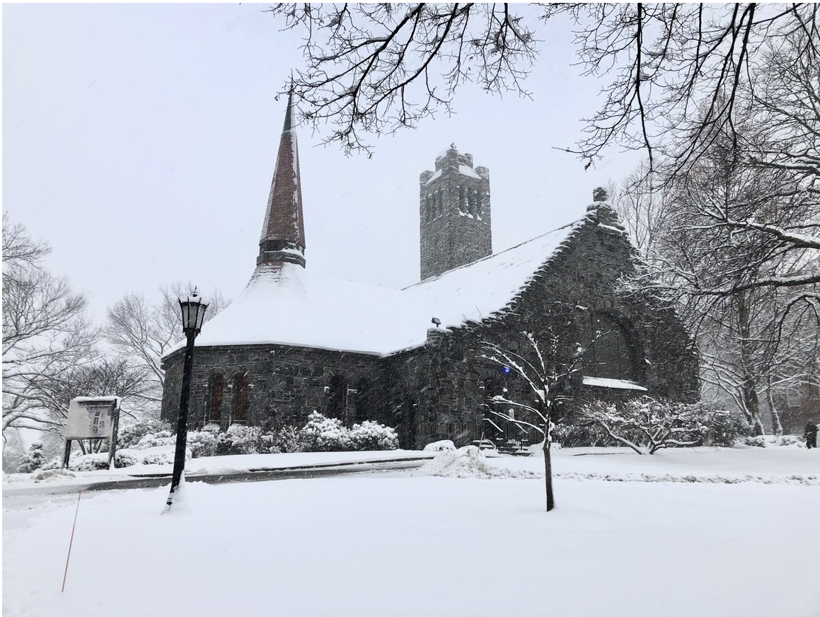
Goddard Chapel in the snow, January 7, 2022