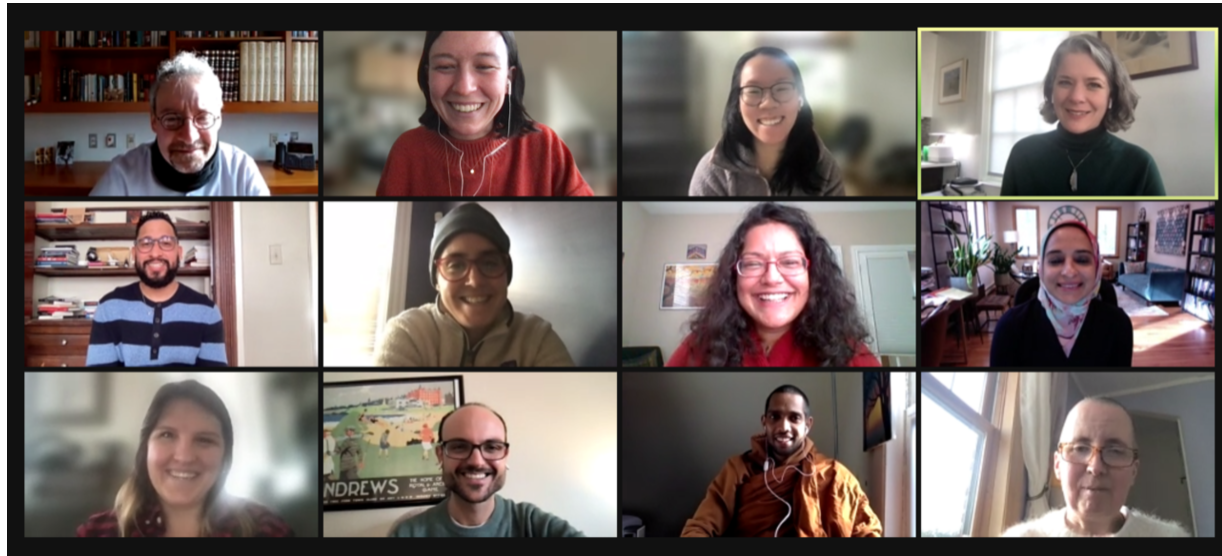
The full University Chaplaincy team smiles at their team retreat, January 12, 2022