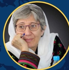
Dr. Sima Samar Former Minister of Women's Affairs, Afghanistan