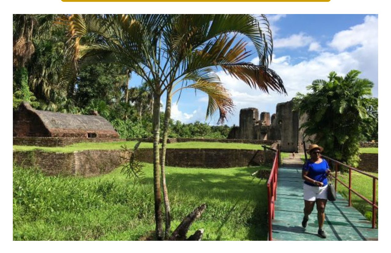
<u>Guyana</u> is becoming world-renowned for its natural treasures. But the rapidly emerging South American destination boasts some pretty cool historic sights, too. Like Fort Zeelandia on the Essequibo River. MORE