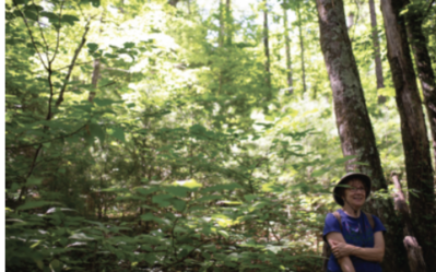
Forest Bathing: How To Cleanse Your Spirit