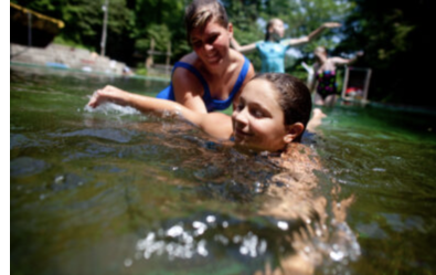
Kidding Around: Seven Sensational Family-Friendly Suggestions