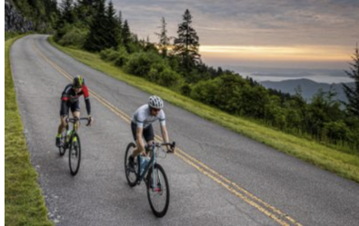
Year of the Trail: Wheely Fun