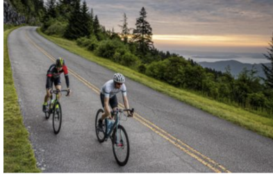
Year of the Trail: Wheely Fun