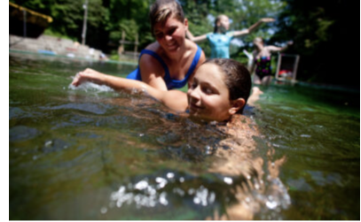
Kidding Around: Seven Sensational Family-Friendly Suggestions