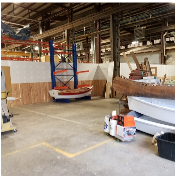
New space takes shape