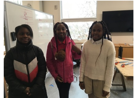
friends comparing scarf joint results!