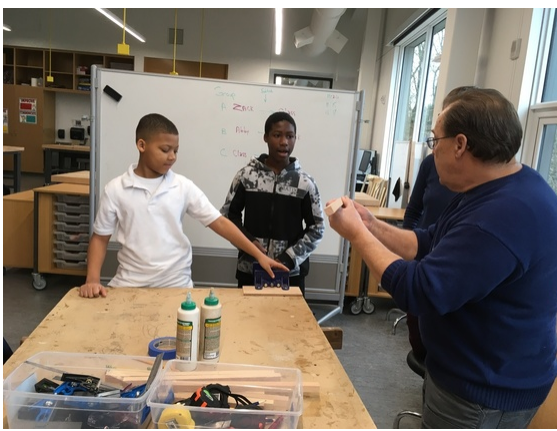
Faubion students learn to build and test "scarf" joints. (wood physics!)