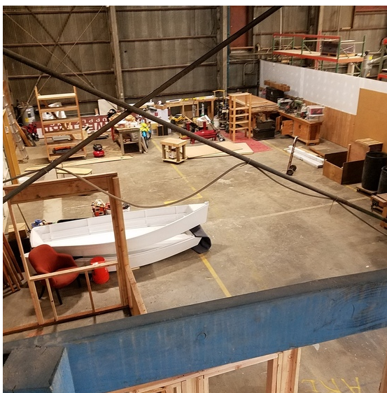
a planned upstairs office giving a view of activities below