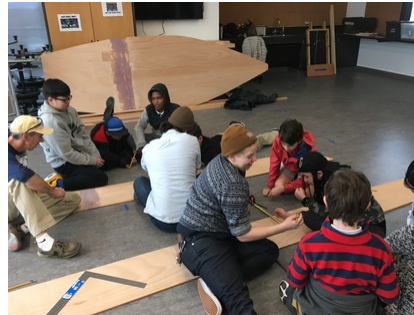
Accurate measuring of the center frame