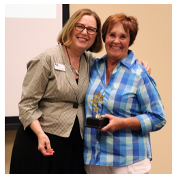
Judy Chaloupka Theatre West