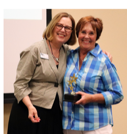
Judy Chaloupka Theatre West