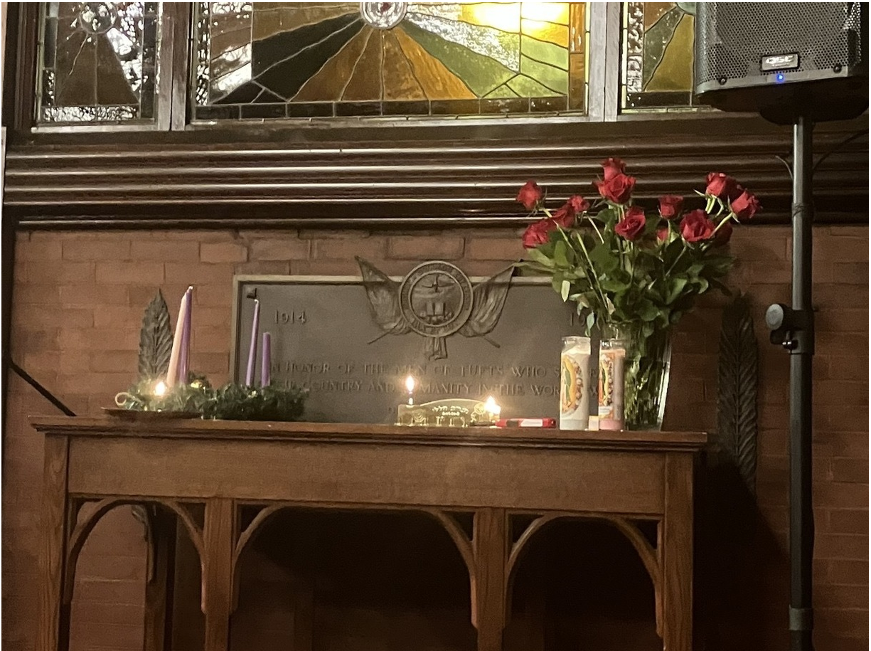
An Advent wreath, diya, hanukkah, and Our Lady of Guadalupe candles prepared for Pax et Lux 2023