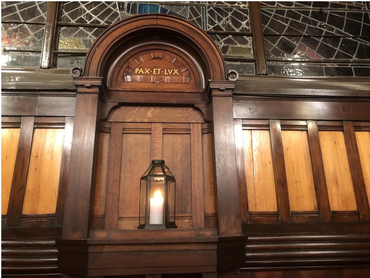
The lit lantern in Goddard Chapel for Pax et Lux

May no obstacle come across your way. May you enjoy fulfillment and long life.