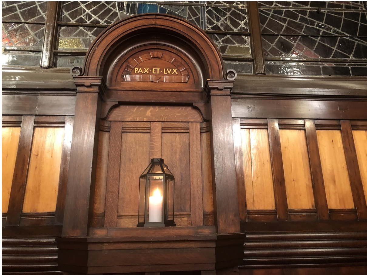
The lit lantern in Goddard Chapel for Pax et Lux

May no obstacle come across your way. May you enjoy fulfillment and long life.