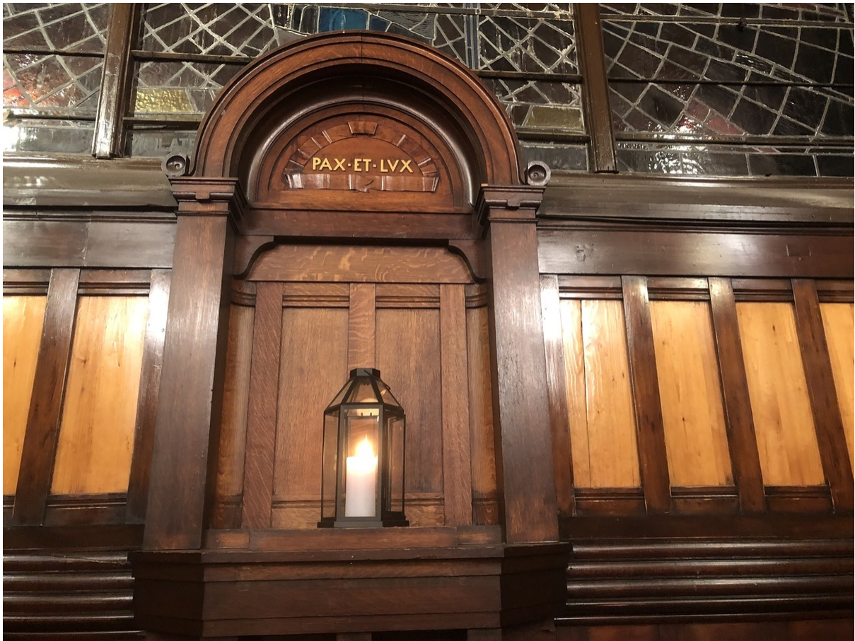
The lit lantern in Goddard Chapel for Pax et Lux

May no obstacle come across your way. May you enjoy fulfillment and long life.