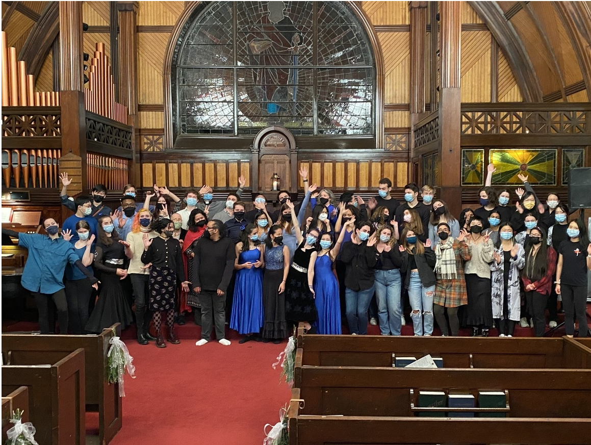
Performers and story-tellers from the Pax et Lux Multifatih Winter Celebration, December 9, 2021