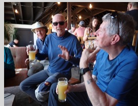
Outer Range Brewery Frisco