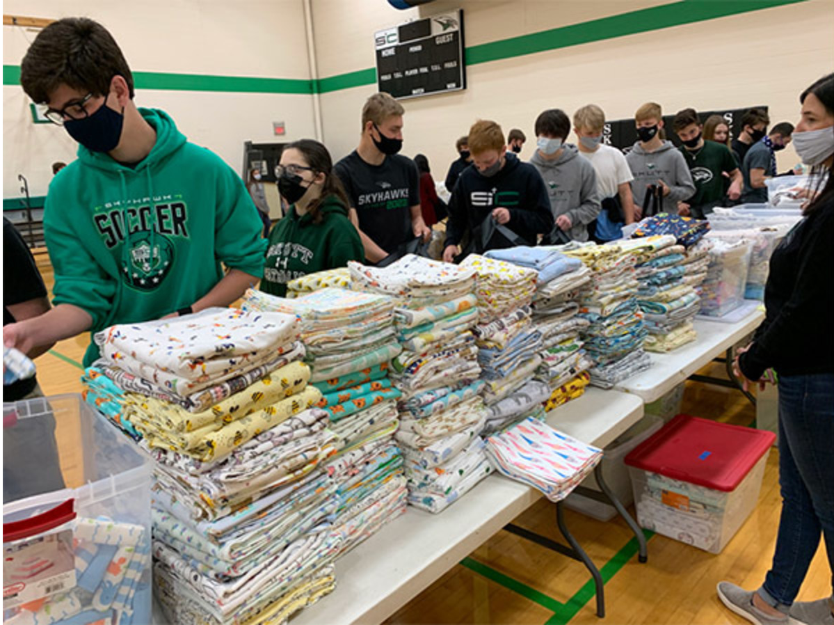
A massive assembly line set up inside Skutt H.S.'s gym allowed students to quickly pack 500 layettes. The diaper bags included onesies, sleepers, a digital thermometer, nail clippers, a baby board book, burp cloths, hooded towel, wash cloths and more!