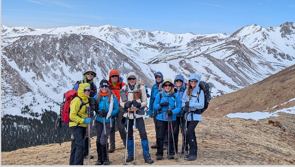
Machebeuf led and