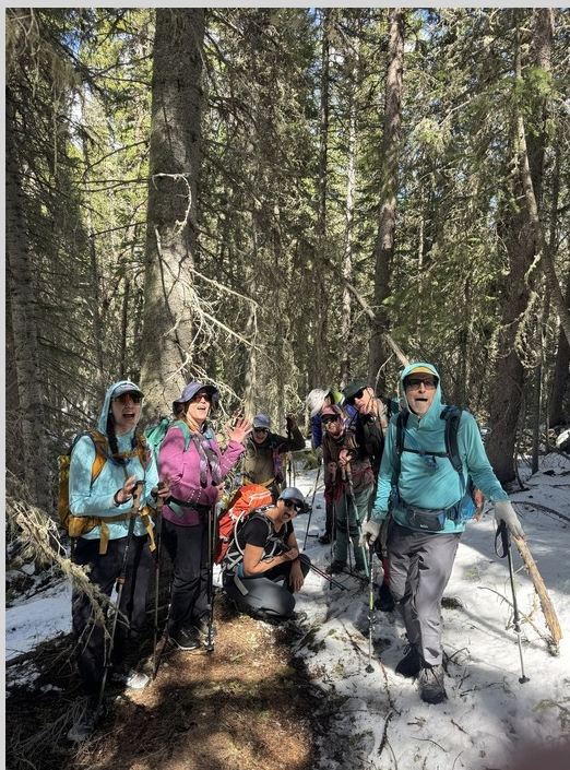
RMNP Blue Bird Lk led and pic by Wayne Howell