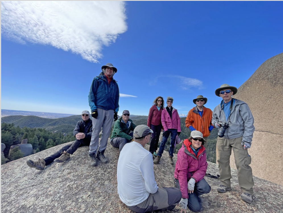
Cave Creek led and