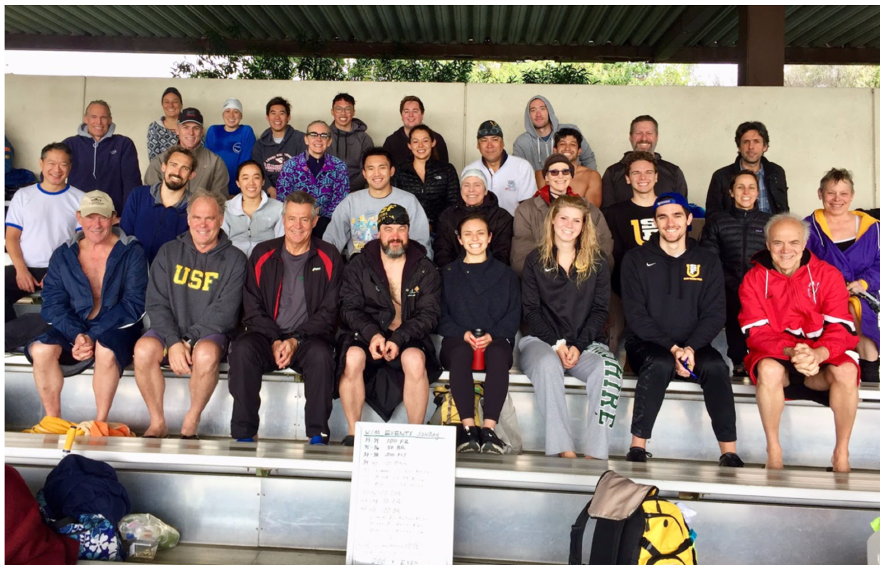
Here's a look back at one of the many great USF Master's team meets - Pacific Masters Short Course Championships, Santa Clara, April 2019.