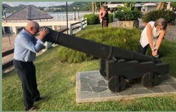
This Couple had a great time celebrating in Sandals Antigua!