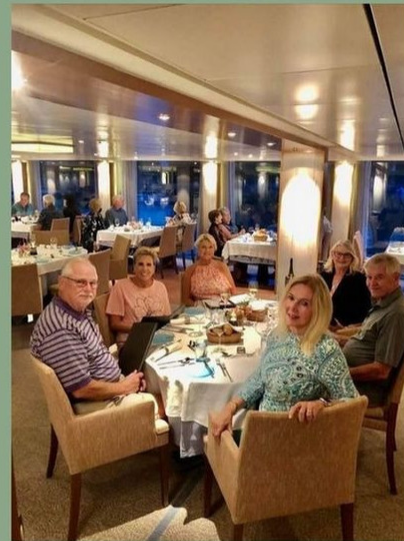
These 6 friends love to travel together – this time on the lower Danube exploring from Budapest to Transylvania