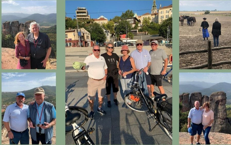
10 Friends found the best time on the Danube!