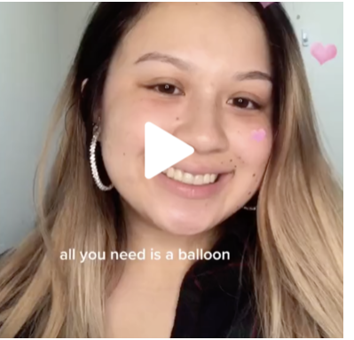
Static science experiment with a balloon!