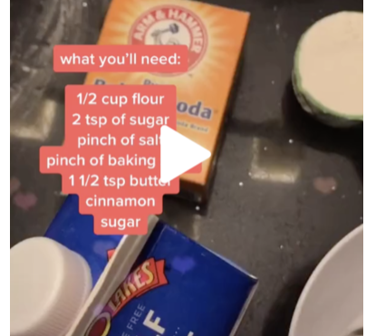
Cinnamon bun in a mug!