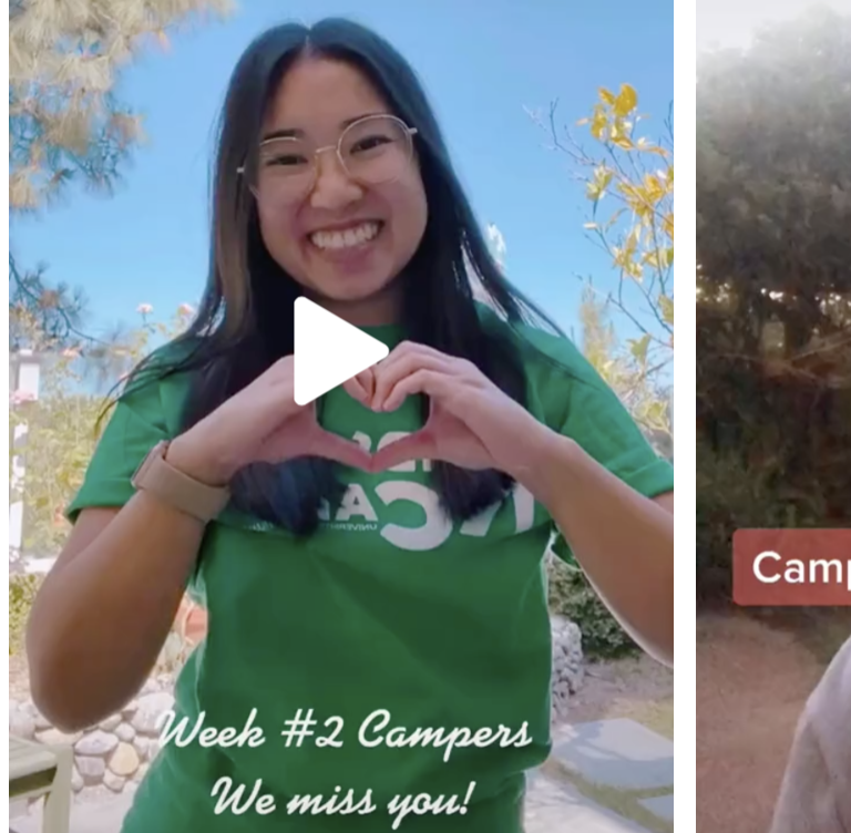
Shoutout to our Week #2 Campers! We miss you!