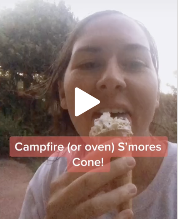
Laugh s'more and worry less!