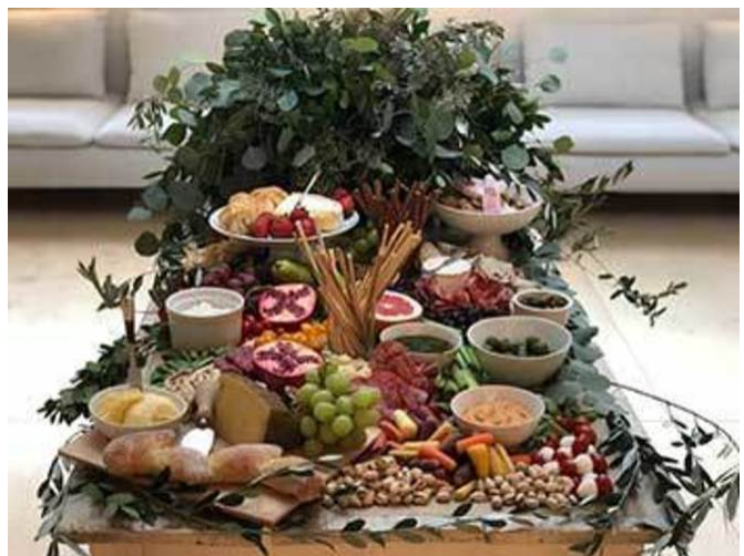
How to Make a Grazing Table for Your Next Party