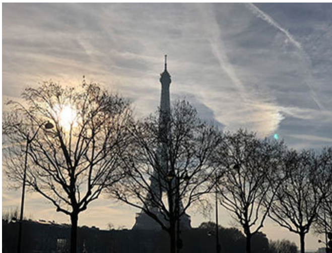
A Perfect Paris Holiday

Here are some of our most popular posts from 2019 and beyond.