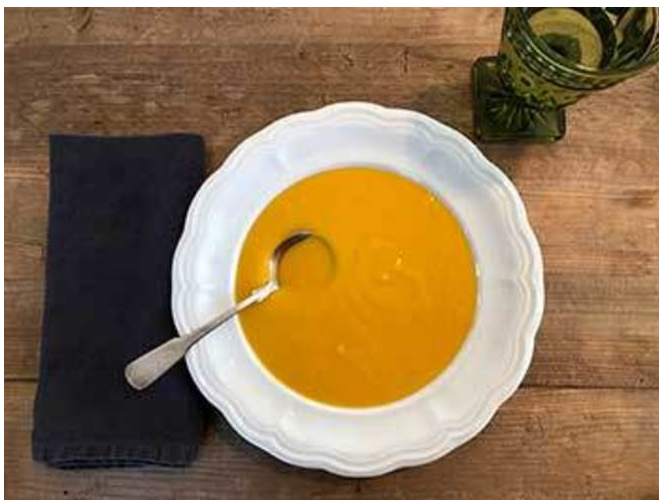
Butternut Squash Soup