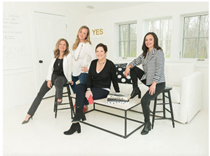
12 Things I've Learned as an Entrepreneur