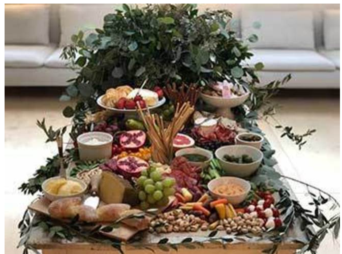
How to Make a Grazing Table for Your Next Party