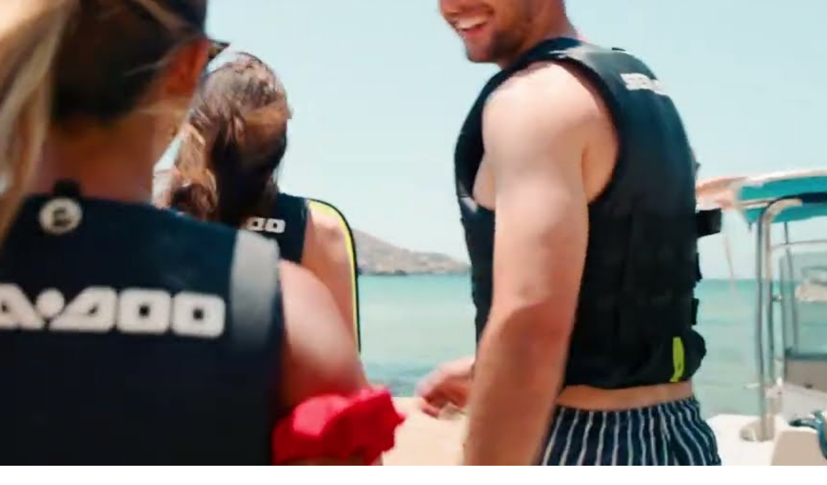
Visit Malta - Time to Explore More!

Pressed for time? With history, sun, food and fun, the Maltese Islands are ideal for Short Breaks with your loved ones, plus there is always so much more!