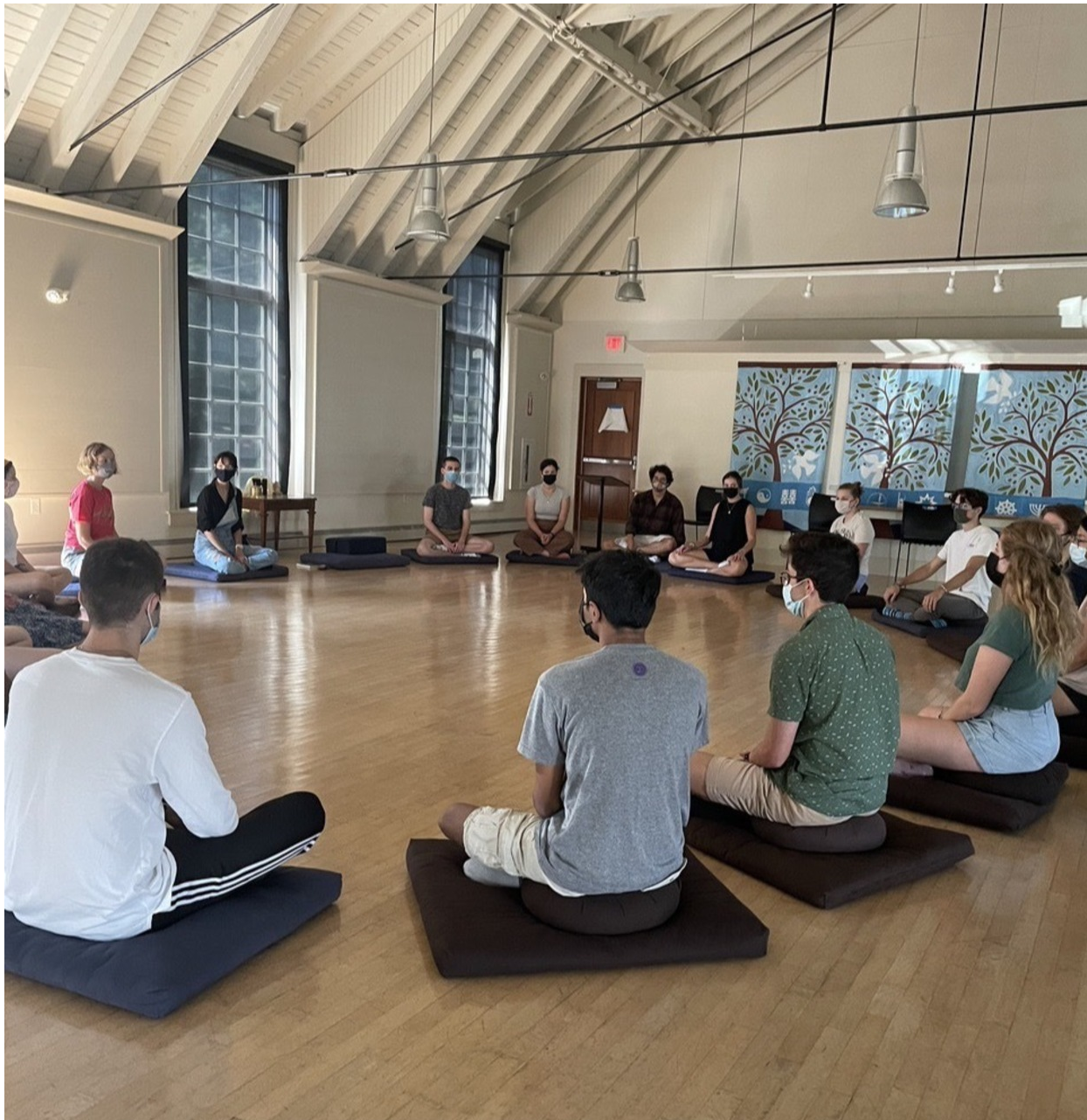
The first Buddhist Mindfulness Sangha meditation of the semester, September 13, 2021