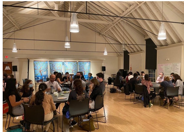
Dinner with the Chaplains Day 3 of CAFE 2021

A few weeks ago, our University Chaplaincy staff and student coordinators welcomed the Class of 2025 into our seventh annual Pre-Orientation Program, CAFE (Conversation, Action, Faith, and Education). CAFE is an interfaith-inspired community engagement program and took place this year over six days on campus in the Interfaith Center, on Zoom for virtual religious site visits, and in our host communities for outdoor visits and historical tours. Over 40 students participated, including first-year students and returning student peer leaders! We were particularly honored to be joined by recent alumnae, who participated in CAFE and the Catholic Community at Tufts as students, for our