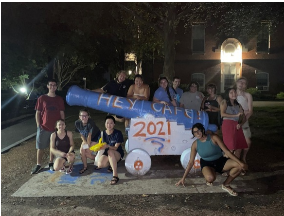
Bonfire & Cannon Painting, Peer Leader Training