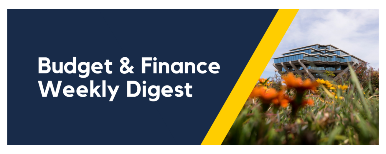
July 5, 2023 | 128th Edition