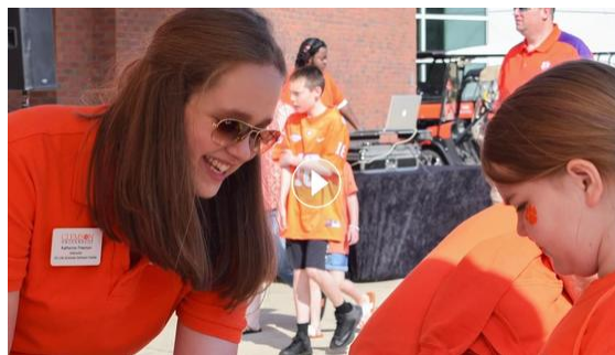
Video highlights from 'Be a T.I.G.E.R. Field Day' capture the spirit of the event.