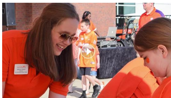
Video highlights from 'Be a T.I.G.E.R. Field Day' capture the spirit of the event.