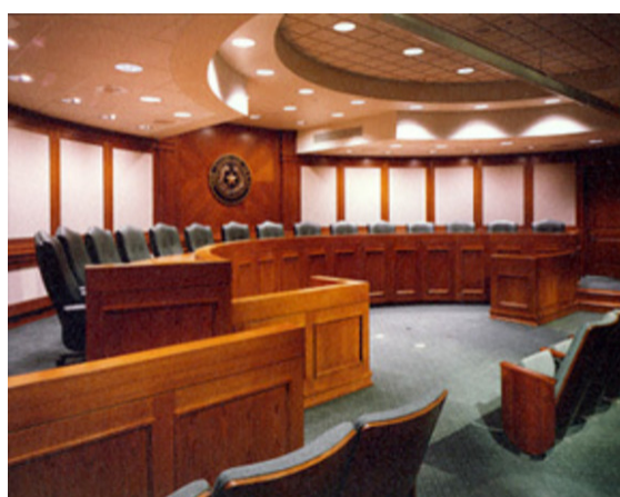
House Committee Hearing Room

Editor's note: we made a correction in the list below. Please use this version for any letter writing or contact with members.