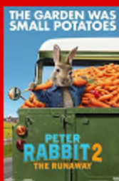
PETER RABBIT 2: THE RUNAWAY JULY 27