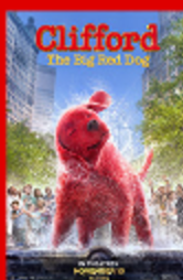
CLIFFORD THE BIG RED DOG AUGUST 3