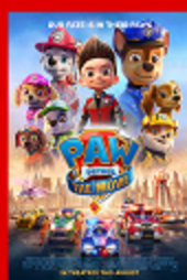
PAW PATROL: THE MOVIE JULY 13