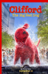
CLIFFORD THE BIG RED DOG AUGUST 3