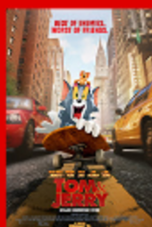
TOM & JERRY JULY 20