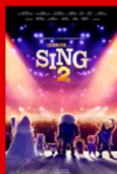
SING 2 JULY 6