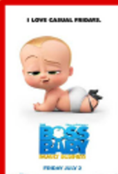
THE BOSS BABY: FAMILY BUSINESS JUNE 15