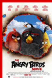
THE ANGRY BIRDS MOVIE 2 JUNE 22