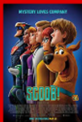
SCOOB JUNE 29