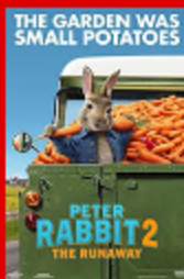
PETER RABBIT 2: THE RUNAWAY JULY 27