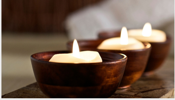
Dry, Winter Skin

Are you suffering from dry, winter skin? We have lip balms, facial masques, gentle cleansers, lotions and creams for all skin types. Go into the new year with glowing, hydrated skin!