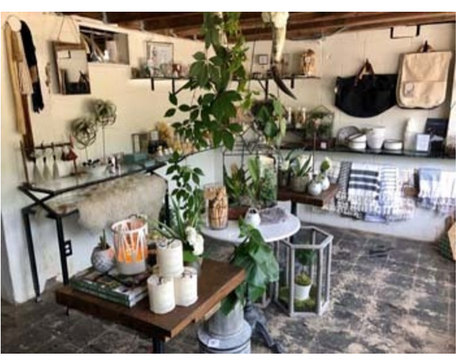
Ivory & Iron, Essex