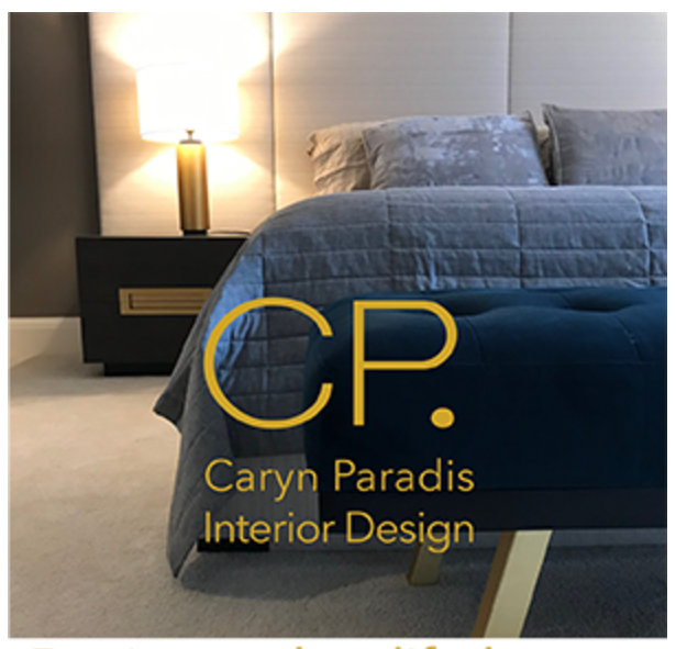
Design makes life better.

P.S. Hoping you will join us this Thursday for my 60th birthday celebration! See below for details.