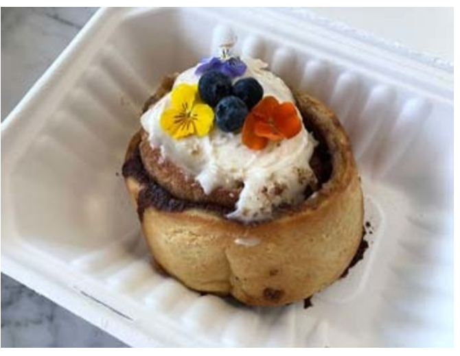
Three Girls Vegan Creamery, Guilford