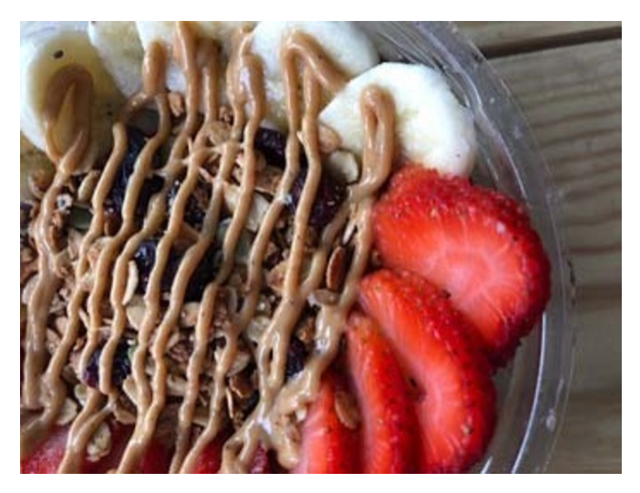
Blend Superfood Cafe, Clinton