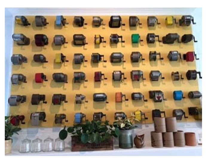
Neighborhood Vintage, Madison