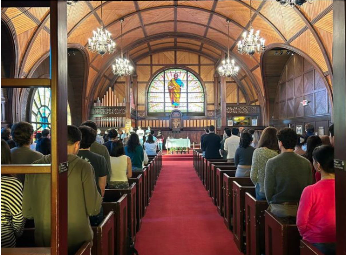
Easter Catholic Mass on Sunday, March 31 in Goddard Chapel