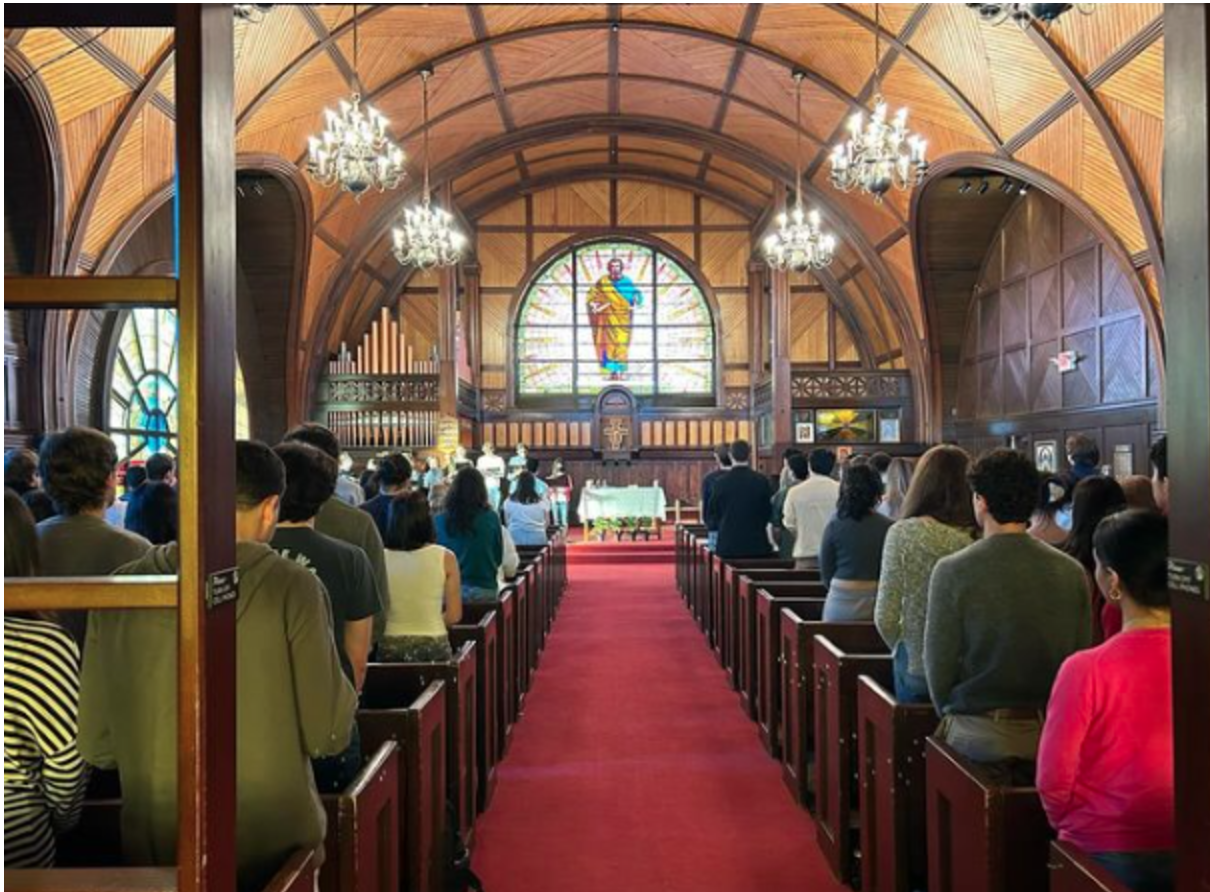
Easter Catholic Mass on Sunday, March 31 in Goddard Chapel