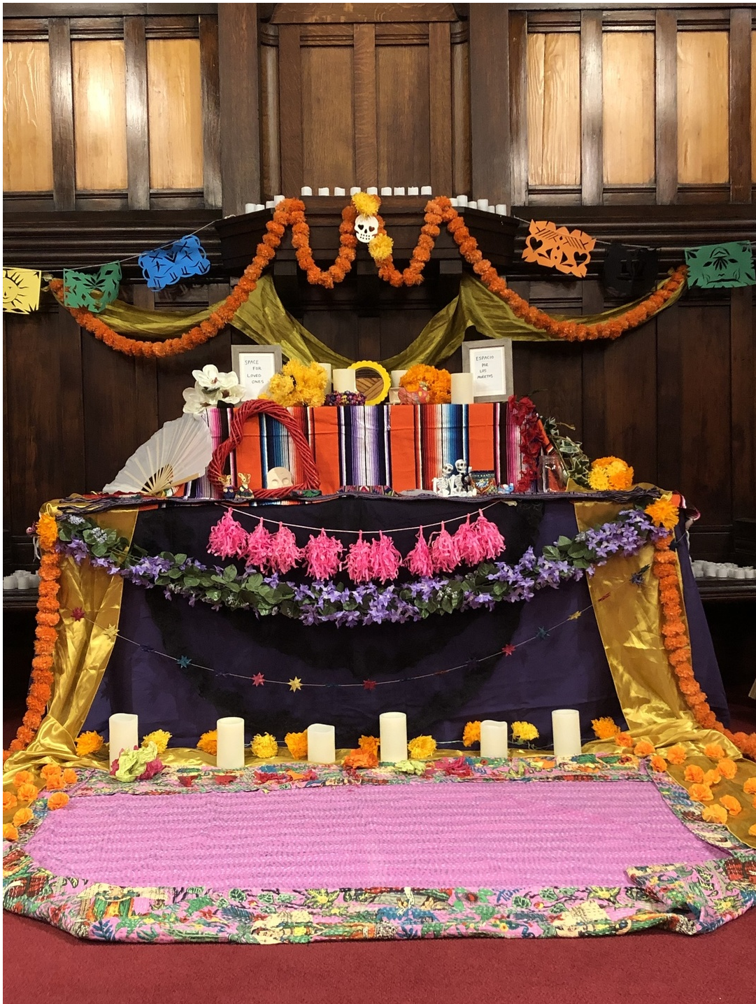
Ofrenda in Goddard Chapel, installed October 31, 2022