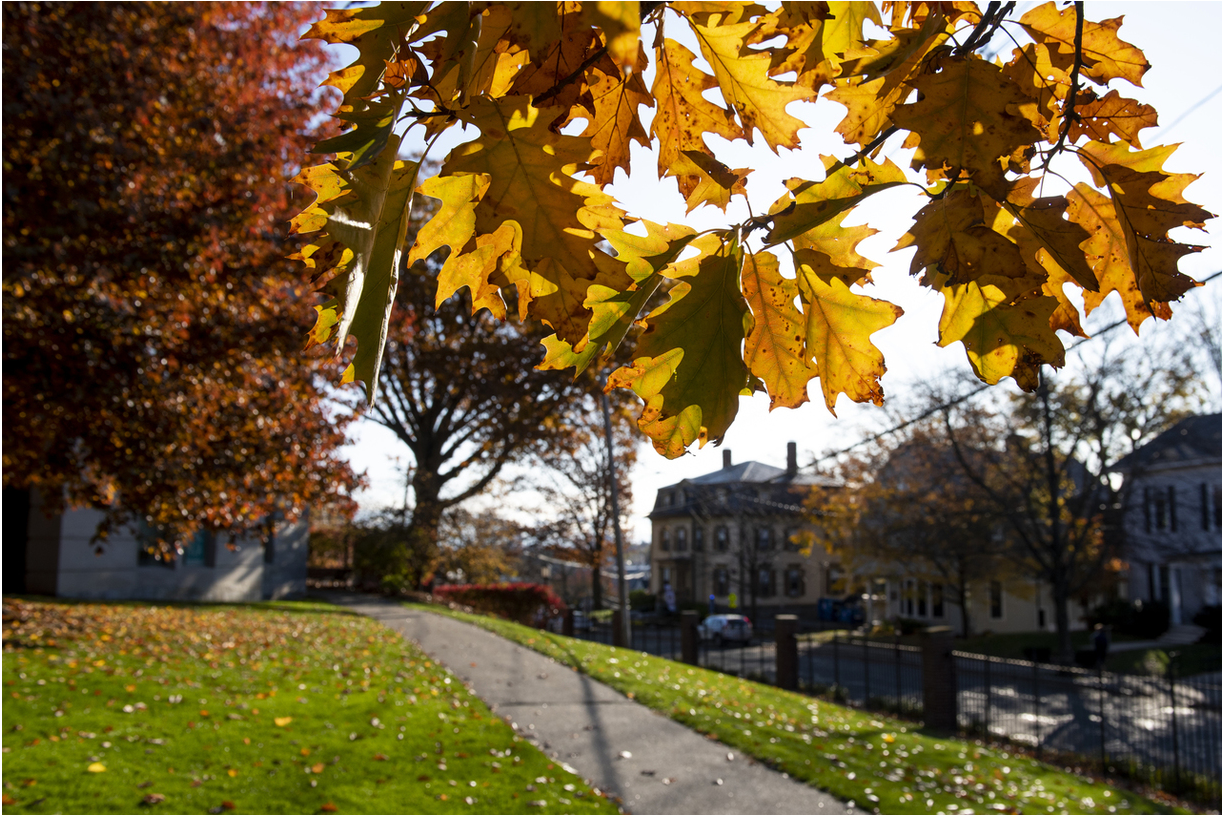
Yellow maple leaves on Medford/Somerville campus