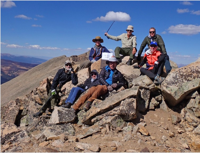
Mosquito Pk loop led and pic by Jim Guerra