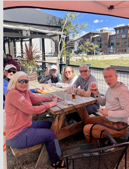
After Uneva Pk, Angry Jims Silverthorne