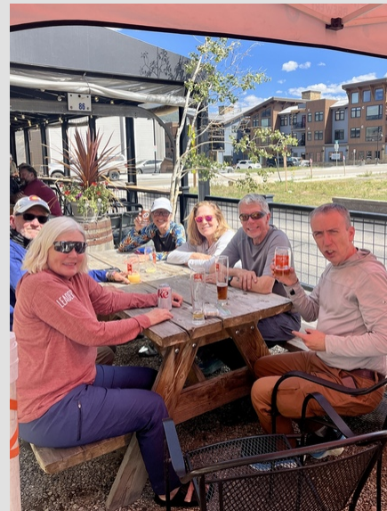
After Uneva Pk, Angry Jims Silverthorne