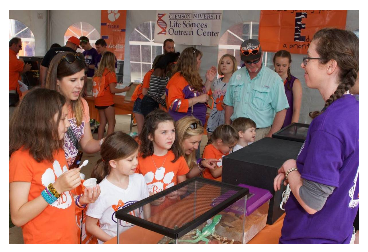
During last year's Clemson Familly Spring Fling, the SCIENCE exhibit attracted hundreds of eager participants.