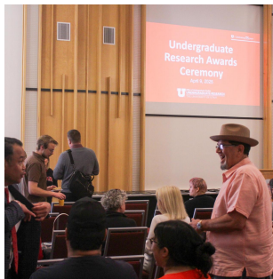
Some photos of our wonderful speakers and the celebration we hosted last week.